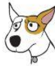
Brow Furrowed, Ears to Side