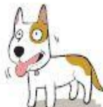
Panting when not hot or thirsty