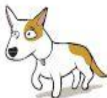
Moving in Slow Motion walking slow on floor