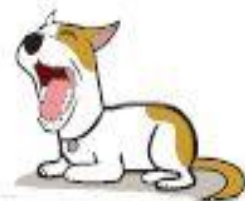
Acting Sleepy or Yawning when they shouldn't be tired