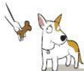
Suddenly Won't Eat but was hungry earlier