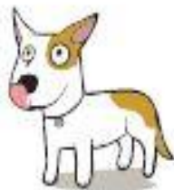
Licking Lips when no food nearby