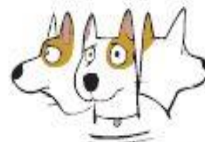
Hypervigilant looking in many directions