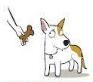
Suddenly Won't Eat but was hungry earlier