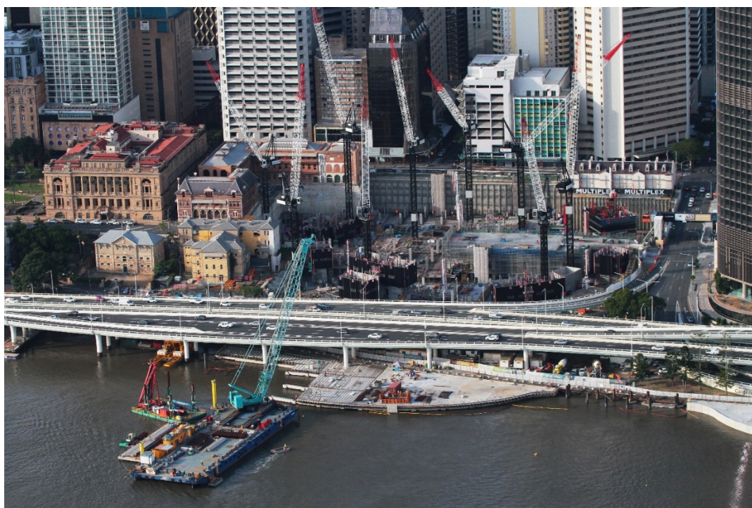
Aerial view from Brisbane River

Media contact - Graham Witherspoon, Destination Brisbane Consortium, 0424 435 345